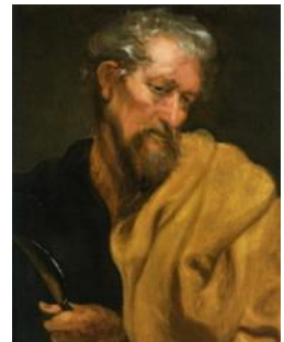
Feast Day 24 August Bartholomew, Apostle & Martyr One of the 12 apostles of Jesus.

Tuesday and Friday, 9:00am, at St Eanswythe's. Everyone is welcome.